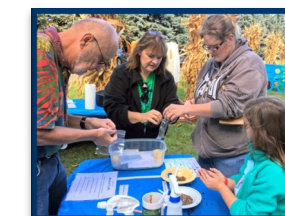
Pollinator Celebration September 2019