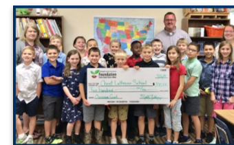
Classroom Grant check presentation at Christ Lutheran School, Sterling.