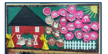
Classroom Door & Bulletin Board Contest March 2019